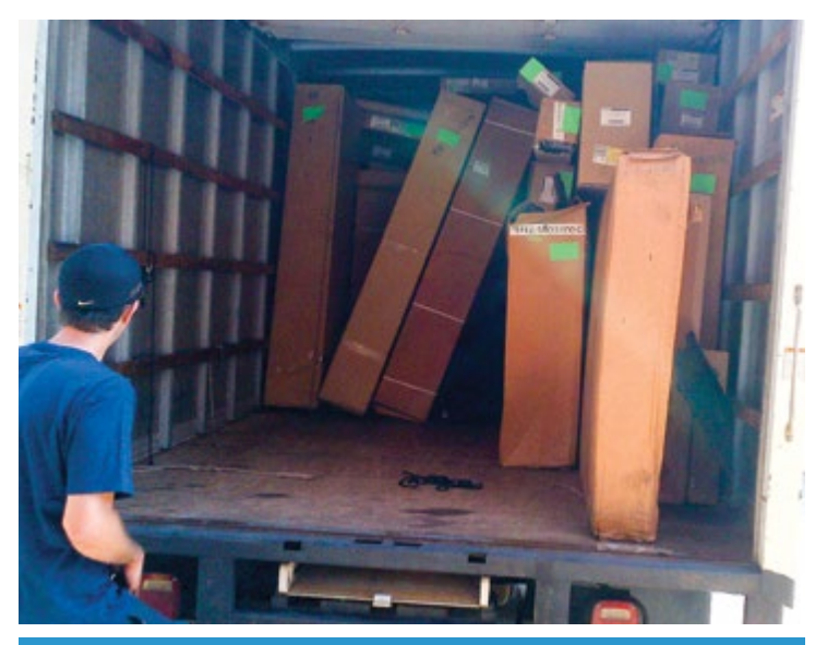
Arlington Heights Ford's donation included current-model hoods, bumper covers, door skins and more, giving some Chicago-area collision repair students hands-on experience with the latest parts.

CREF is actively looking for other dealerships to follow Arlington Heights Ford's lead on donating parts, but it also works with independent body shops and other industry members interested in supporting college and high school collision programs through other in-kind product or monetary donations. For more information, contact Brandon Eckenrode at Brandon.Eckenrode@ed-foundation.org or 847-463-5244.