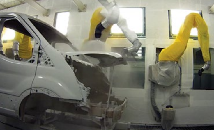
The two-wet monocoat process uses a primer coat that requires only a few minutes of open-air drying time before the color coat is applied. The color coat is formulated with the same appearance and protection properties of the clear coat, which eliminates the need for a separate clear coat. The painted body is fully cured in an enamel oven after the color coat is applied. The total process removes one paint-application step and one oven-drying step when compared to conventional paint processes.

The new, two-wet monocoat paint process, developed by Ford and its paint suppliers, is expected to cut carbon dioxide emissions by 9,500 tons and particulate emissions by 35 tons annually when compared to conventional paint processes. In addition, an innovative dry-scrubber system will help save more than 10.5 million gallons of water, while the overall process should save 48,000 megawatt hours of electricity, enough to power 3,400 homes.*